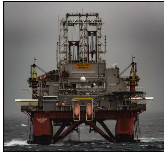
Figure 1: Transocean Barents MODU

Well construction activities completed during this program will be performed in accordance with Canada - Newfoundland and Labrador Offshore Petroleum Board (C-NLOPB) regulations. The C-NLOPB will issue an Operations Authorization (OA) and Approval to Drill a Well (ADW) prior to drilling. This program will also be conducted in accordance with Equinor Canada Ltd. governing principles.